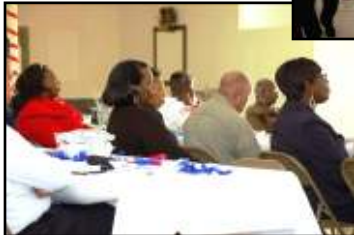
Several church members, local dignitaries, and guests join together in paying tribute to this country's Veterans.