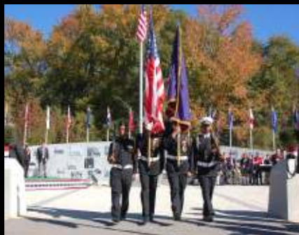
Henry County ROTC presented the Colors to open the ceremony and retires the flag at the conclusion of the activities.