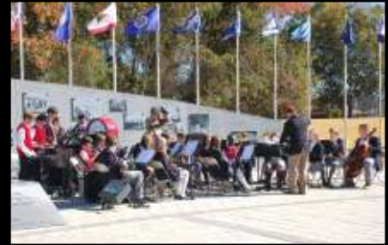
Strong Rock High School's Orchestra played a selection of patriotic songs.