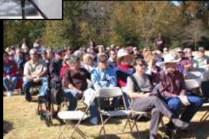
The crowd is large and hearts humble as McDonough and Henry County say "THANK YOU" to this country's Veterans.