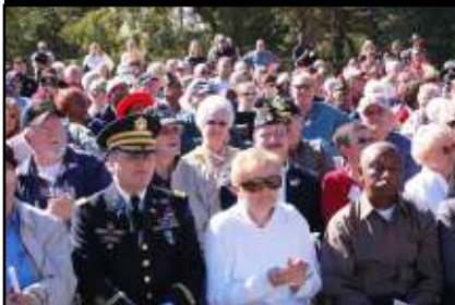
Retired Veterans in uniforms from past military service stand out in the crowd.