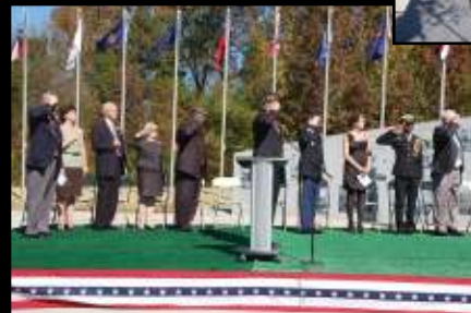
As TAPS is played, everyone stands in silence as salutes and hands over hearts are evident throughout the large audience.