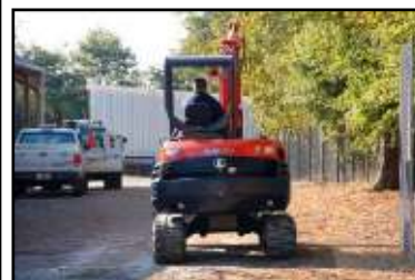
At the end of the day, the Kubota is unloaded at the shop and parked out of the weather to await its next call to duty.