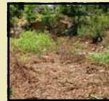
Site in planning stages.

You can expect to see the City striving to improve and expand maintenance of our infrastructure with the use of Geographic Information System (GIS). To assist our crews, we are currently receiving training in the use of GIS equipment.