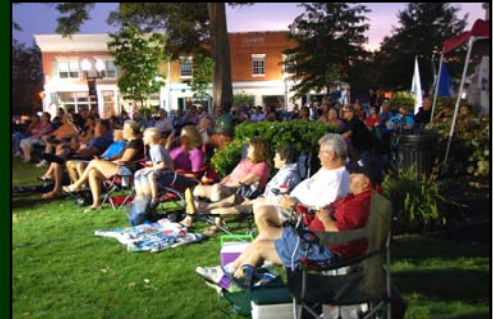
The delayed start due to heavy showers could not put a damper on the evening.