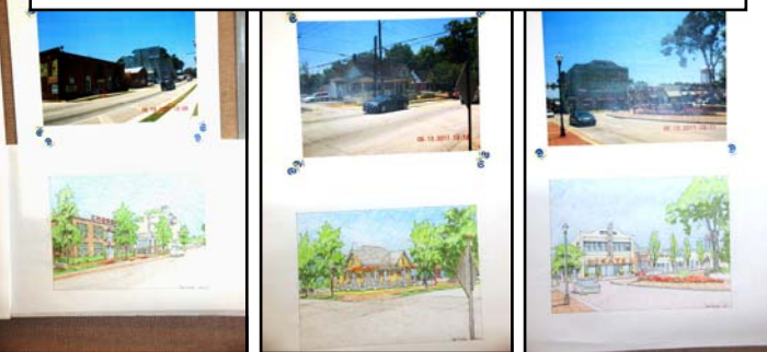
One possible makeover for the buildings across from the Judicial Building on John Frank Ward Blvd.