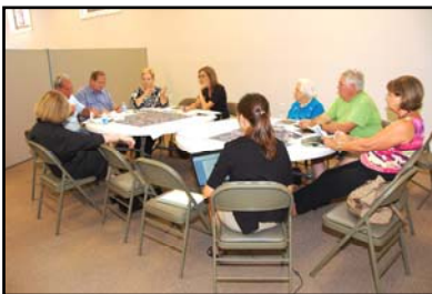
The Monday afternoon roundtable discussion consisted of 9 local citizens with knowledge of senior needs.

who might wish to have a voice in the vision for the central downtown business district of McDonough.