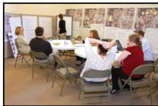
At the end of the each day's sessions, it's time to reflect.

One important factor that he could not stress strongly enough was that of unity in effort. One going alone does not make a major impact. That one, taking a hundred others with him/her, suddenly becomes an audience. Truly an eye-opening session for everyone that was present.