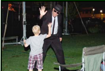
This young lad feels the beat as he dances the entire night away to the music of the Alabama Blues Brothers.