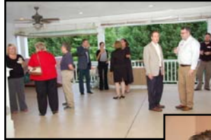
Attendees gather on the veranda to enjoy lemonade and cookies.