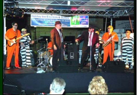
The band in action provides a very funny and entertaining show.