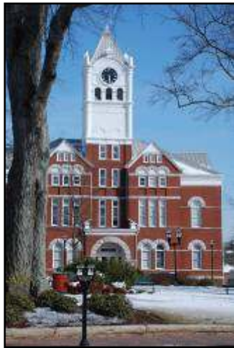
The Henry County Courthouse, on the McDonough Square, is always beautiful, especially in snow.