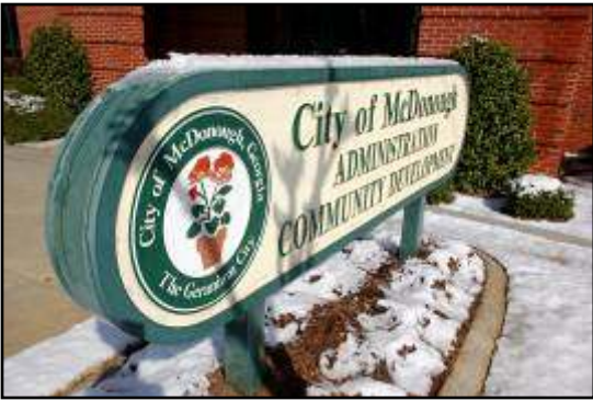
Snow in McDonough is certainly a rare sight but one welcomed by many adults and every school age child in the county. This sign on Keys Ferry Street, located in front of McDonough City Hall, still has minimal snow on Monday from the snow storm that passed through on Sunday, March 1st.