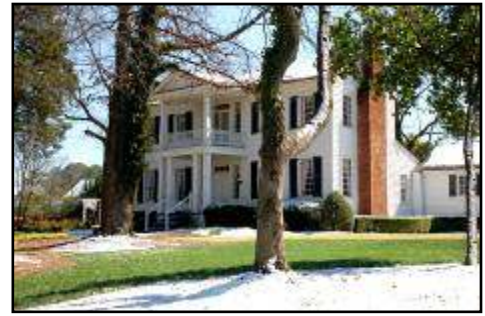
The Hazlehurst House on Sloan Street, a premier events center, is always a beautiful reminder, in any season, of the City's historic past.