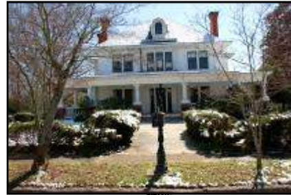
This elegant home on College Street glistens in the early afternoon sun with a dusting of snow still sitting contentedly atop the shrubs and in spots where the sun's rays have yet to melt.

Snow.....Some people love it, others hate it, but every- one reacts to it!