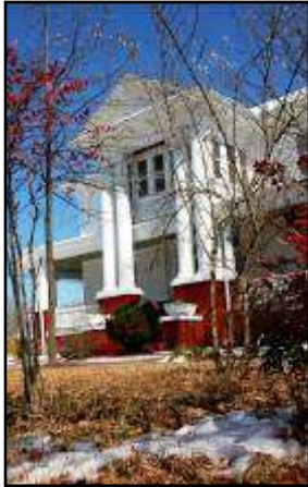
This beautiful home, located on the corner of Sloan and Macon Streets, has very little snow left by Monday.